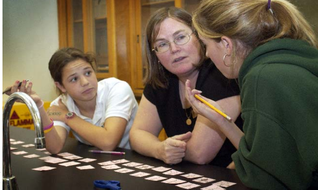
son (center) seience teacher of the year/state. St. Joseph's Academy, a-04-04.

Fall 2004: Test piloting for Environmental